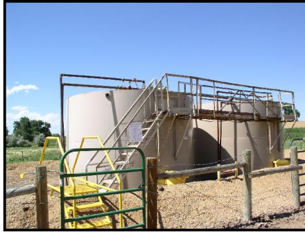
Spill prevention, response, and cleanup