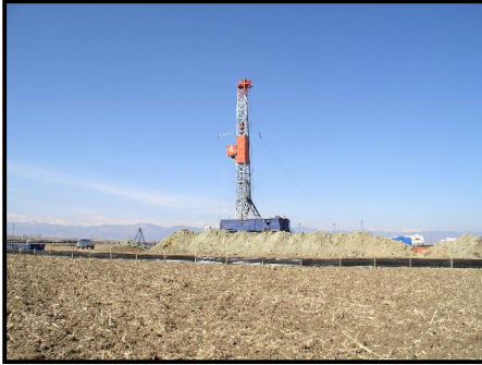
Stormwater and surface water protection