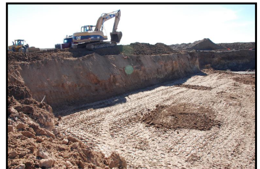
Geotechnical compaction testing

Potable water well sampling Chemical exposure monitoring E & P waste facilities Remediation system design, installation, and operation H2S sampling SPCC plans and inspections Environmental site investigations